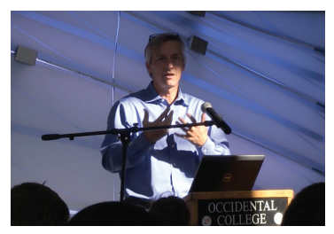
For Call's full talk, please click the image above.