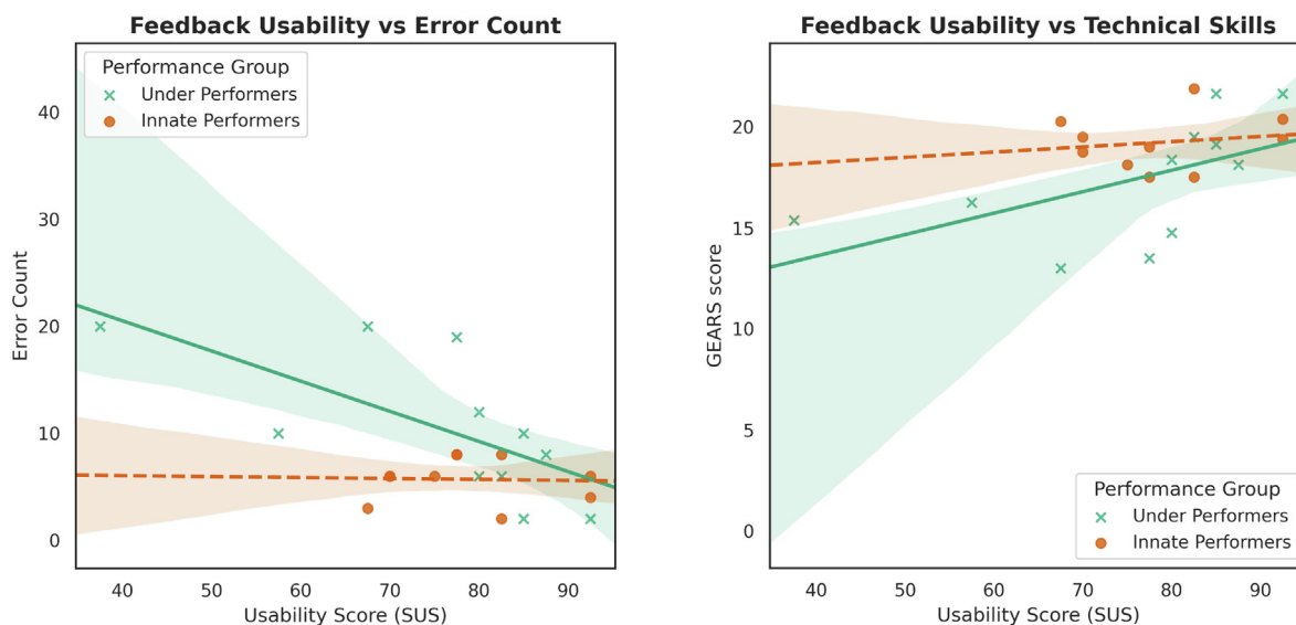
Fig. 3 – Empirical correlation of the System Usability Scale (SUS) score with the error count and technical skills score (GEARS) for underperformers and innate performers. The difference in slope shows that the feedback was more important in helping underperformers than innate performers. GEARS = Global Evaluative Assessment of Robotic Surgery.